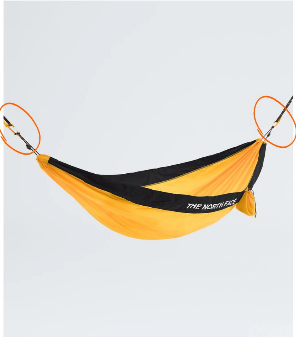
Carabiner - Outdoor - USA - The North Face